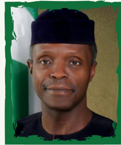
Vice President Yemi Osinbajo, SAN, GCON Chair, PEBEC

Background: On Thursday May 18, 2017, Nigeria's Acting President, His Excellency, Prof. Yemi Osinbajo SAN, signed an executive order on transparency and improving the business environment in Nigeria.