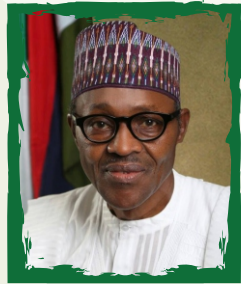
President Muhammadu Buhari, GCFR